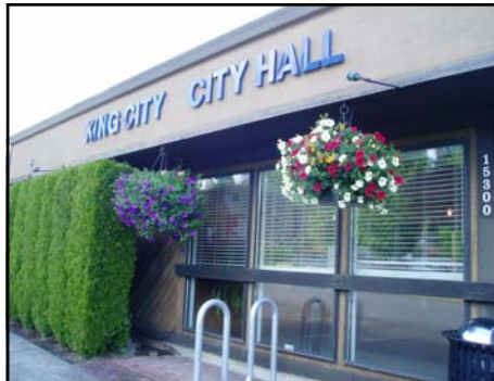
15300 SW 116th Avenue Phone: 503-639-4082 King City, OR 97224 Fax: 503-639-3771

We will keep our newsletter focused on City business. If you have any question or comments for the staff and/or Council about the city, please email or call us, we might publish your question or comment!